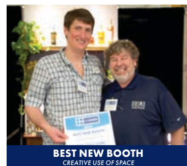
BEST NEW BOOTH CREATIVE USE OF SPACE