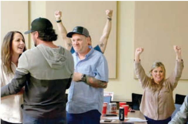
They got that one right!