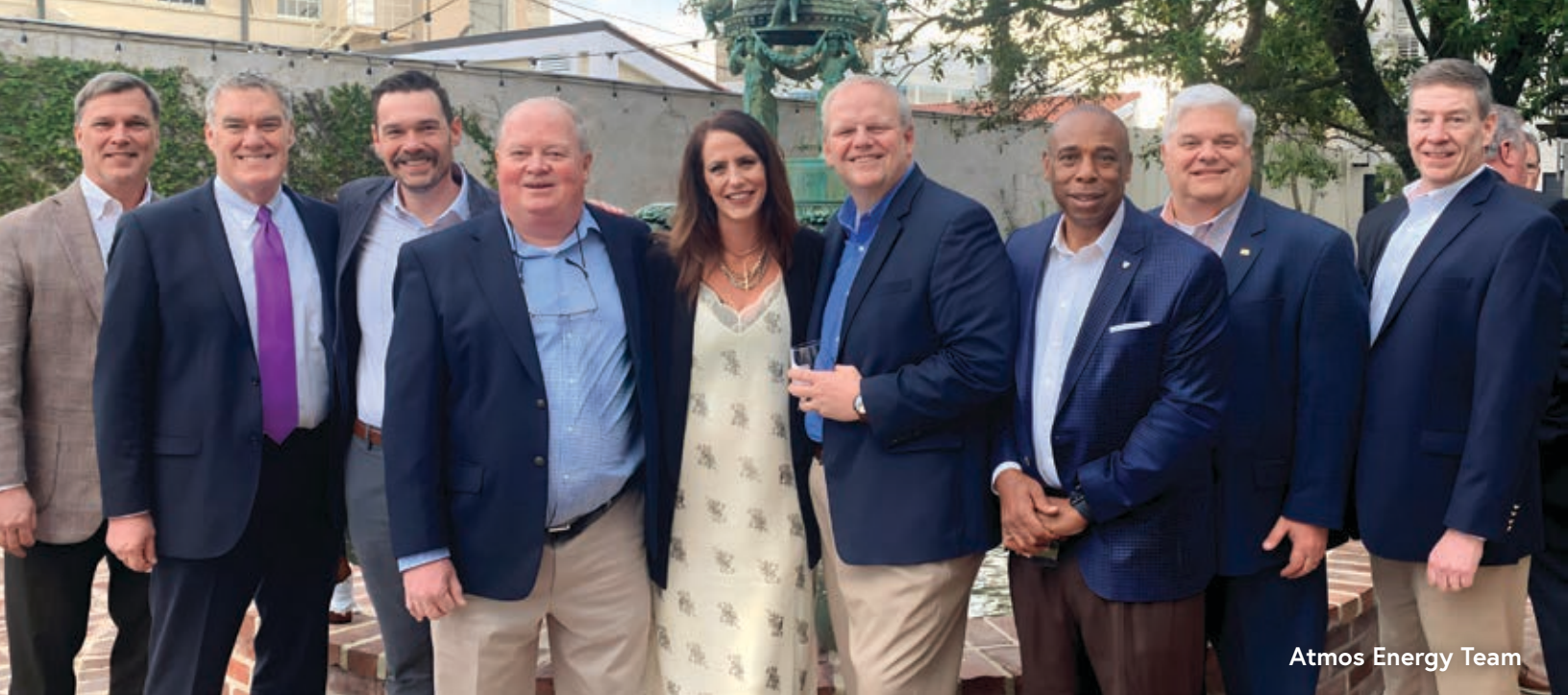
Atmos Energy Team