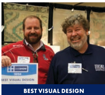
BEST VISUAL DESIGN