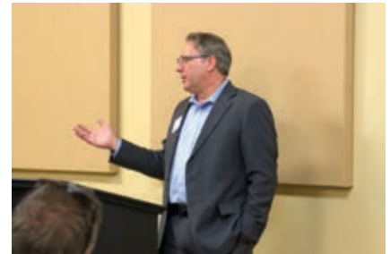
Carson Law Firm