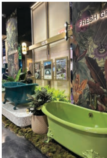
Builder Show Products