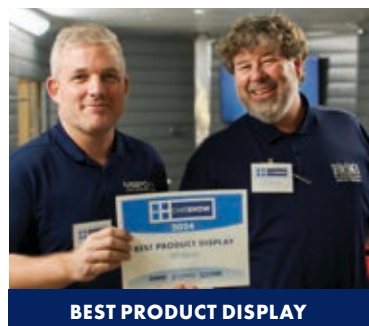
BEST PRODUCT DISPLAY