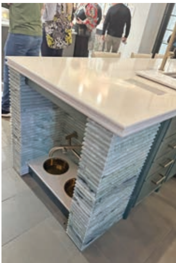
Builder Show Products