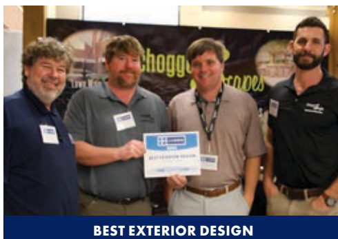
BEST EXTERIOR DESIGN