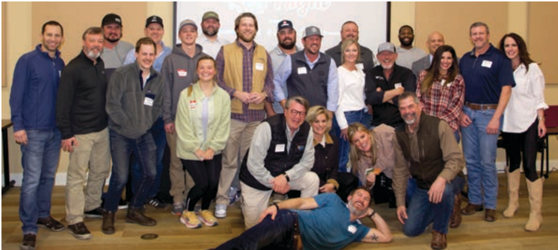
Fun group for Trivia Night - Smart, too!