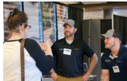
MidSouth Crawl Space Solutions