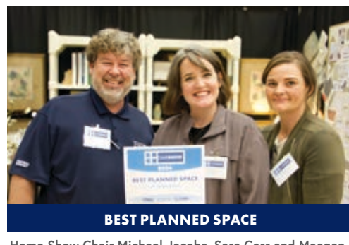
BEST PLANNED SPACE