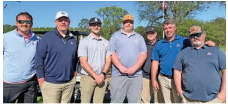
84 Lumber Team

84 Lumber held a customer appreciation golf outing at Canton Country Club on April 4. A great time was had by all.