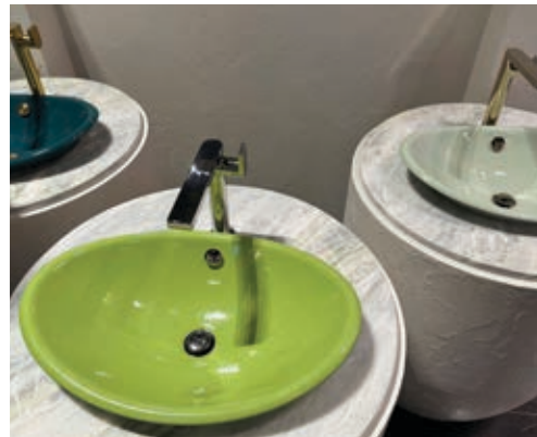
Builder Show Products