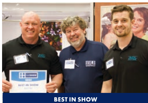
BEST IN SHOW