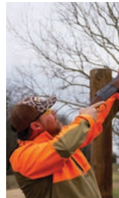
DeFord Walker, Southern Heritage Construction