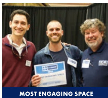
MOST ENGAGING SPACE