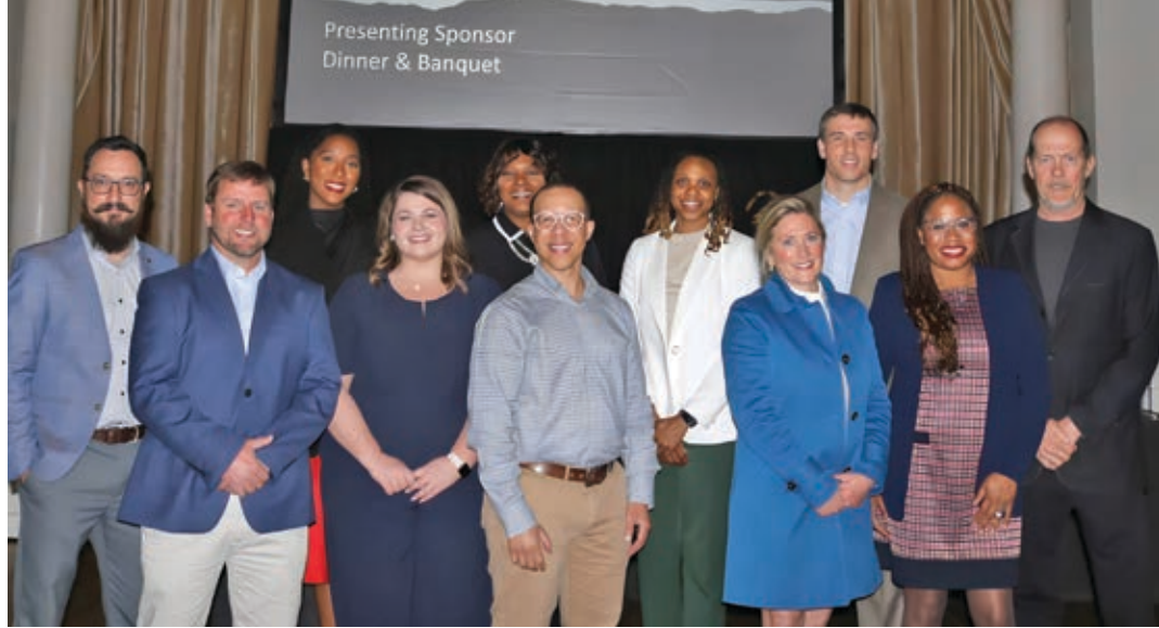
Best in MS - Entergy Group